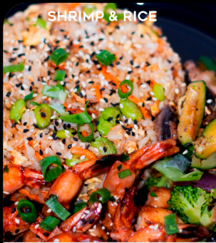
SHRIMP & RICE